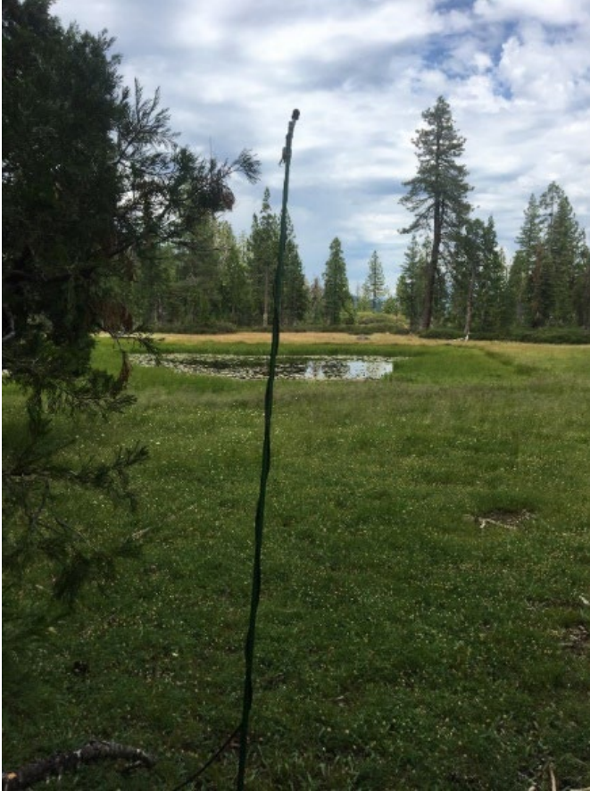
Figure 1. Example photo from behind the microphone, facing the same direction as the microphone, to include with NABat acoustic data submission. The goal is to capture a view of the space the detector is sampling.